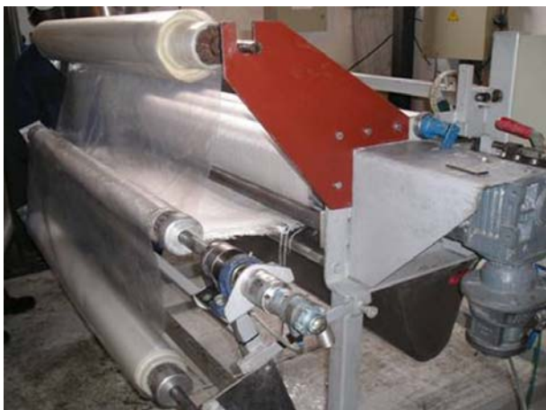
Glass fibre during the preparation process for FRP partition wall element

ManuBuild strives to develop components that will offer 'plug & play' capability and permit the seamless assembly of new and open building components and systems. For such smart components, that add value to the client and user, the concrete, steel and fibre reinforced polymer composite has been picked as an example for illustration. Composite materials consist of two or more distinct physical phases, one of which, the fibrous, is dispersed in a continuous matrix phase. Composites offer the designer a combination of properties that are not available by using traditional materials (concrete, steel and wood). Having access to a light-weight partition wall is pivotal to flexibility of the home over the life-cycle. The ManuBuild partner Mostostal from Poland is developing a partition wall element based on glass fibre.